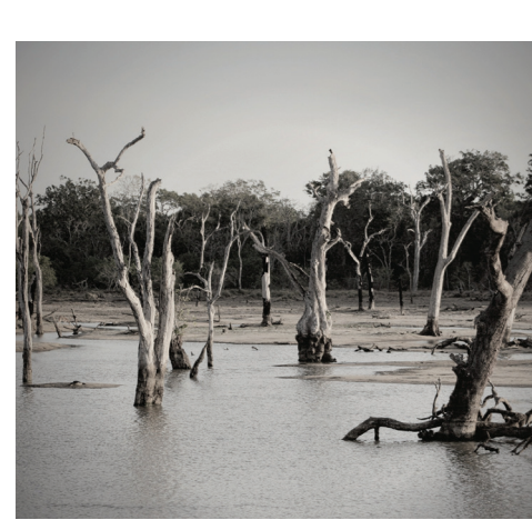
CDR offers a promising and potentially transformative option for reducing the costs of climate change and lessening the risk of high-impact tail scenarios.

Enacted laws and legislative proposals offer different mechanism to expand the deployment of DAC technologies. Signed into law by President Joe Biden in November 2021, the Infrastructure Investment and Jobs Act includes an allotment of $3.5 billion over five years for DAC hubs. If carried out successfully, the hubs "each have the capacity to capture and store and/or utilize one million metric tons of CO_2 per year, will be networks of DAC projects, potential CO_2 off-takers, transportation infrastructure and storage infrastructure."<sup>6</sup>