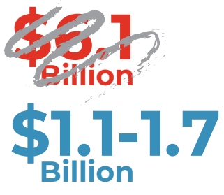
This was due to the ability of the market to direct capital to its most efficient abatement opportunities.

The Acid Rain Program's Cap-and-Trade Mechanisms Is Considered a Success and Cheaper Than Expected