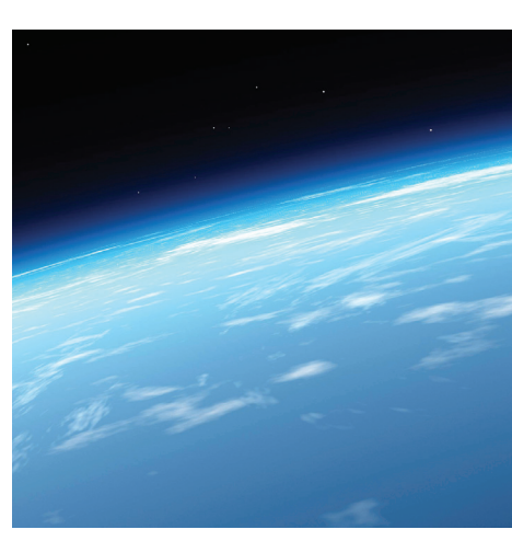
Unlike reducing soot from a smokestack or smog from a city, climate change is a global collective action challenge, because CO<sub>2</sub> is dispersed evenly throughout the atmosphere.

The demand for CDR credits will only keep growing. Several major oil companies, including British Petroleum, Royal Dutch Shell and Total, have committed to achieving carbon neutrality by 2050.<sup>16</sup> While this could theoretically be achieved through carbon offsets, firms will likely seek to procure as many CDR credits as possible. Carbon offsets, which are credits for activities that negate or avoid greenhouse gas emissions, have struggled with credibility issues. Many carbon offsets are awarded based on counterfactuals that are unlikely, such as preservation for forests that likely would have never been logged, or the preservation of foreign renewable energy projects that would have been built without carbon offset revenue.<sup>17</sup> As past R Street Institute research has noted, there are credible ways to utilize and develop carbon offsets, but given that CDR credits do not have issues with legitimacy, they are likely to be in higher demand for firms that view carbon neutrality as important to their reputation.<sup>18</sup>